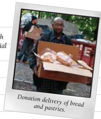
Donation delivery of bread and pastries.

11:30am The Church in ACTS – Lunch - Volunteers from The Church in ACTS came today to prepare lunch for our patrons. They come the second Monday of each month and have been a supporter of New Visions for the past 3 years.