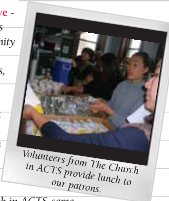
Volunteers from The Church in ACTS provide lunch to our patrons.

11:45am Temple Beth Shalom / Congregation M'Kor Shalom Delivery - Temple Beth Shalom in Cherry Hill and M'Kor Shalom each delivered a U-Haul Truck full of food donations (canned food drive in honor of Yom Kippur). We received approximately 45 bags, filled with canned goods. As a result of receiving the canned food from generous donors and supporters of New Visions, we are able to provide families with emergency food bags each and every day. When the truck(s) arrived, 10-15 student volunteers from Salesianum High School formed an assembly line to stock our shelves. New Visions has established a tremendous partnership with a variety of high school groups, college groups, and church groups; including the Romero Center, Salesianum High School, Father Judge High School, Merion Mercy Academy, Bishop Eustace Preparatory School, St. John's Church (Collingswood NJ), Holy Saviour Church (Westmont NJ) among many others.