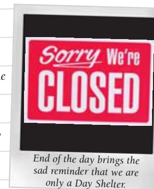
End of the day brings the sad reminder that we are only a Day Shelter.

7:00pm Ministries Awareness Fair - St. Mary's Catholic Church - Before the day is completely over, I am happy to head to St. Mary's Catholic Church in Cherry Hill and promote New Visions at its Ministries Awareness Fair by distributing information and answering questions about New Visions and Lutheran Social Ministries of New Jersey, and the necessity of utilizing our God-given gifts and talents to continue to live out the Gospel message.