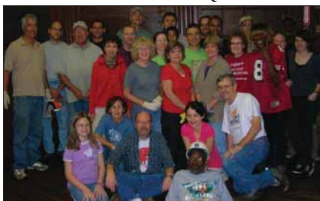
Volunteers from St. John's Catholic Church in Collingswood & Church of the Holy Saviour in Westmont.

NON-PROFIT ORG U.S. POSTAGE PAID BENSALEM, PA PERMIT NO. 179