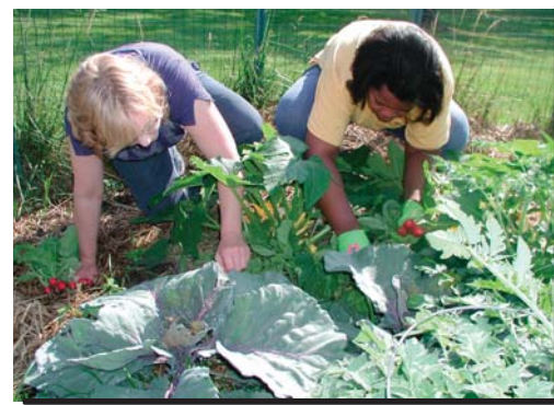
Subaru employees harvesting produce from the Subaru "Share the Love Garden"

"This is a unique program, and I'm thrilled that the garden continues to exceed our expectations," explains Sandy "The corporate culture at Subaru is as unique as the garden, and this program fits very well with our drive, passion, and commitment to our community."