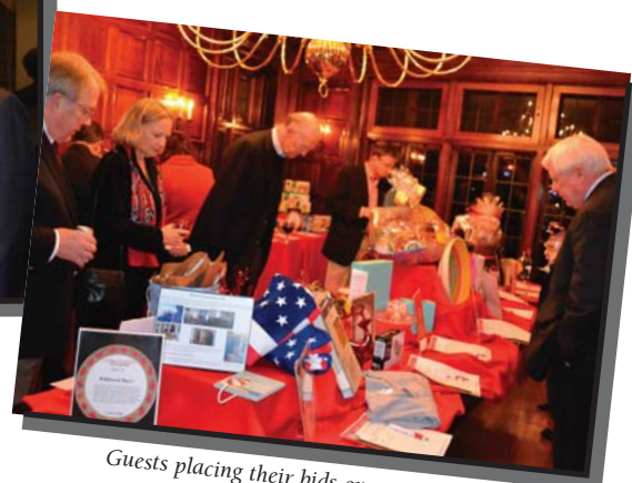
Guests placing their bids on auction items