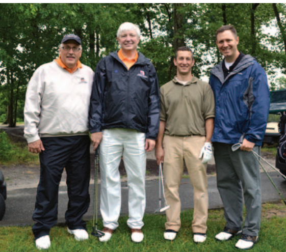
Spring Golf Classic