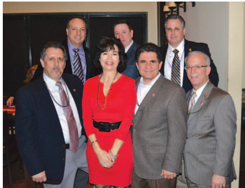
Mardi Gras in Monte Carlo

New Visions serves more than 175 men, women, and children every weekday, offering them access to basic services—breakfast, lunch, showers, laundry facilities, a food pantry, a clothing closet, mail services, and job assistance. Please know that your continued support and participation in LSM/NJ Foundation events such as the annual Monte Carlo Night is truly life-saving to those who need a helping hand.