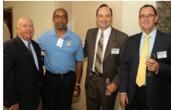
LSM/NJ Corporate Administrative Office Ribbon Cutting