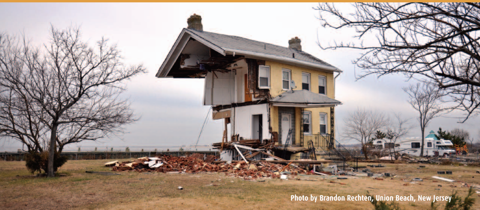
Union Beach, New Jersey

On October 29, 2012, Hurricane Sandy roared up the northeastern coastline. Within a matter of hours, its high winds and heavy rain caused tremendous destruction and widespread flooding throughout New Jersey. Forty residents from 13 counties lost their lives, over 2 million households lost power, and many people were displaced from their homes and businesses. The need for help, especially along Jersey's hardest-hit shore towns, was instantaneous. LSM/NJ is the New Jersey affiliate for Lutheran Disaster Response (LDR), an ELCA ministry that helps mobilize the efforts of Lutherans from around the country.